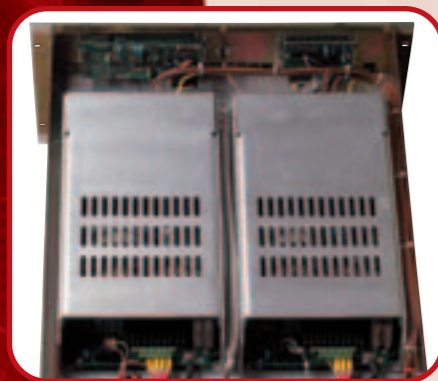
SWITCHING POWER SUPPLY