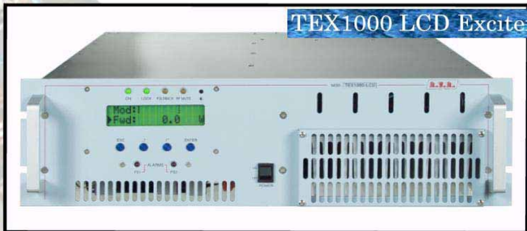
TEX1000 LCD Exciter