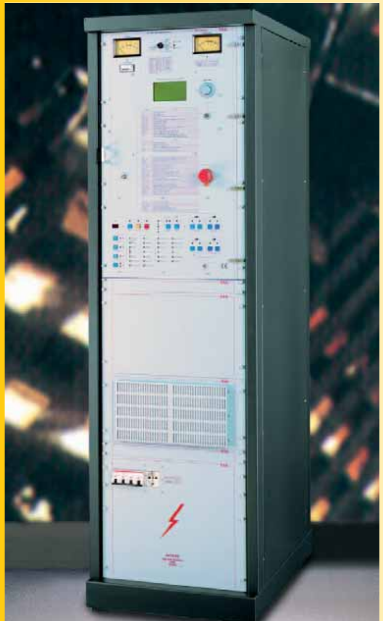
These specifications are subject to change without notice.

Black-Box event history recorder Built-in remote control capability Motorized tuning for input, plate and load, covering the entire 87.5 - 108 MHz range.